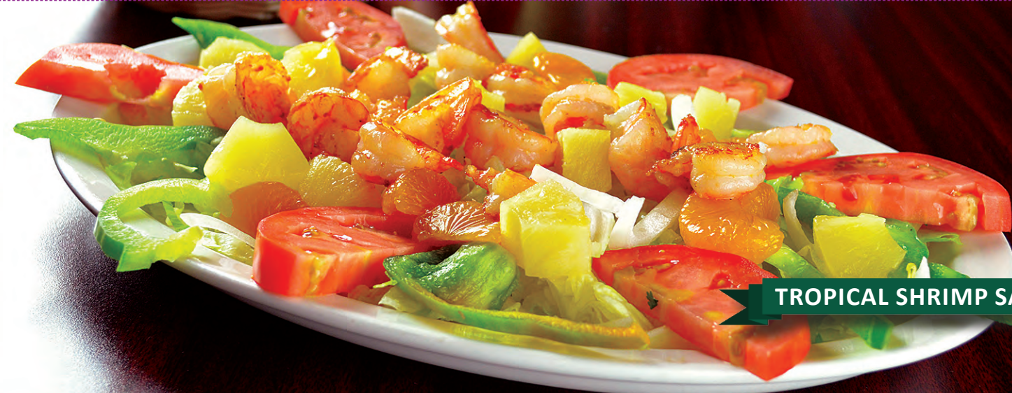
TROPICAL SHRIMP SALAD